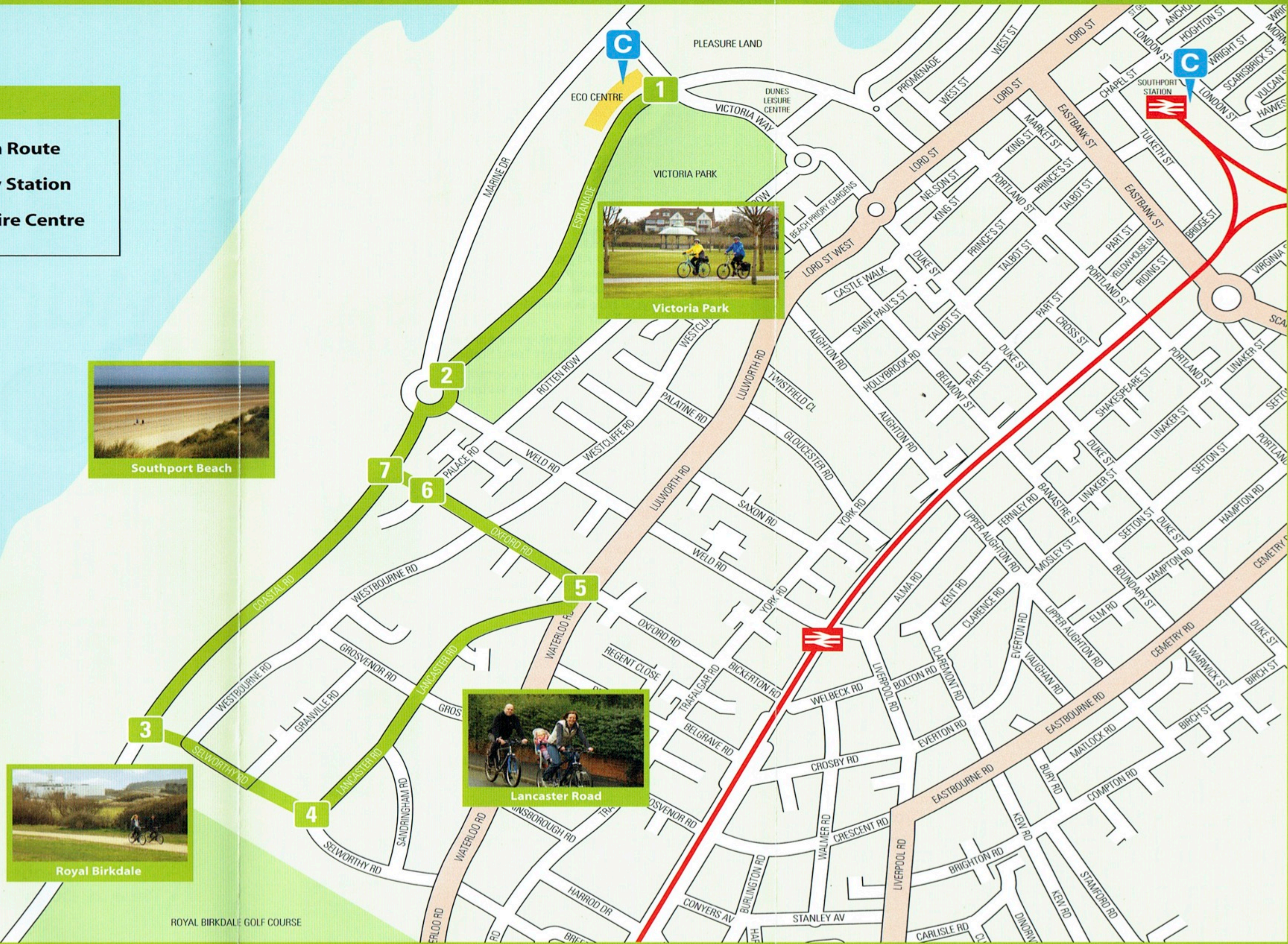
ROYAL BIRKDALE GOLF COURSE