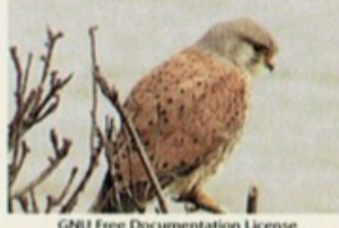
GWU Free Documentation License

Along this route you will enjoy the resorts varied urban landscapes and the newly developed community woodland. You will pass through King's Gardens, Portland Street playing fields and then Newlands, the Community Woodland. This is home to a variety of wildlife and Kestrels can regularly be seen hunting over head.