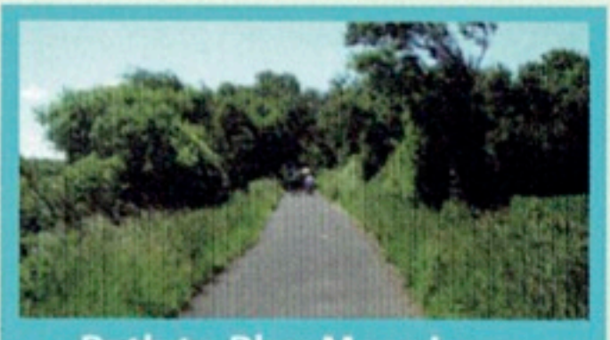
Path to Plex Moss Lane