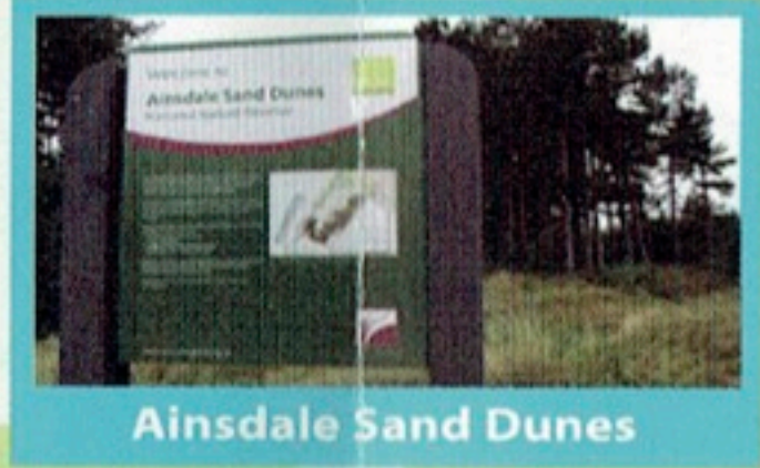
Ainsdale Sand Dunes