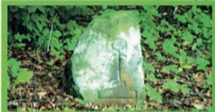
St. Lukes Church Godstone